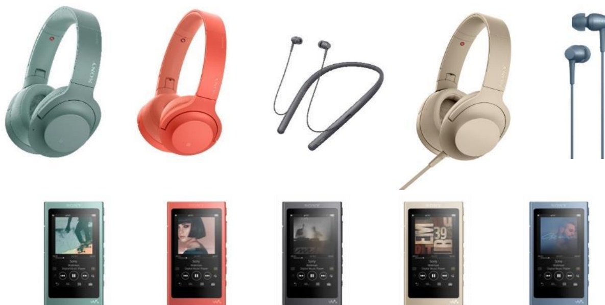
WH-H900N in Horizon Green, WH-H800 in Twilight Red, WI-H700 in Grayish Black, MDR-H600A in Pale Gold, IER-H500A in Moonlit Blue and Walkman® NW-A40 Series

New Walkman® in matching colour variations for music lovers to fit their styles