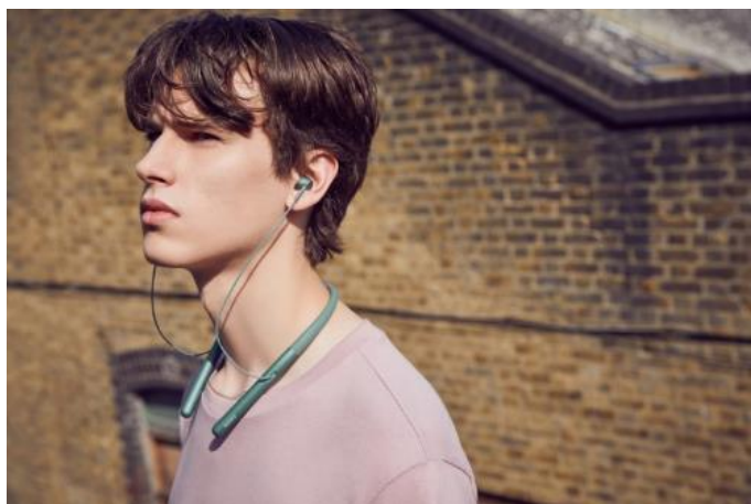
WI-H700 in Horizon Green

Perfect for listening to music, taking calls and so much more, the h.ear in 2 Wireless WI-H700 is the wireless behind-the-neck style option of the series. With a magnet clip to secure at the ends, this pair takes away the hassle with wires and benefits with a handy call vibration to notify you of incoming calls. With 8 hours of battery life in such a compact size, the h.ear in 2 Wireless fits seamlessly into your everyday life.