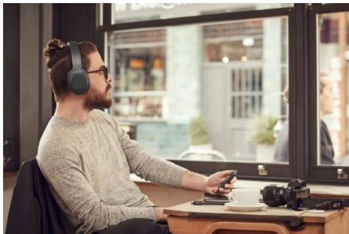
NW-A40 series Walkman® with WH-H900N in Grayish Black

digital amplifier built in, with DSEE HX™ it will upscale your existing library of music while also being able to play DSD files 2 , it works as a USB DAC for your PC music files. This digital music player is also compatible with MQA™ 3 file format.