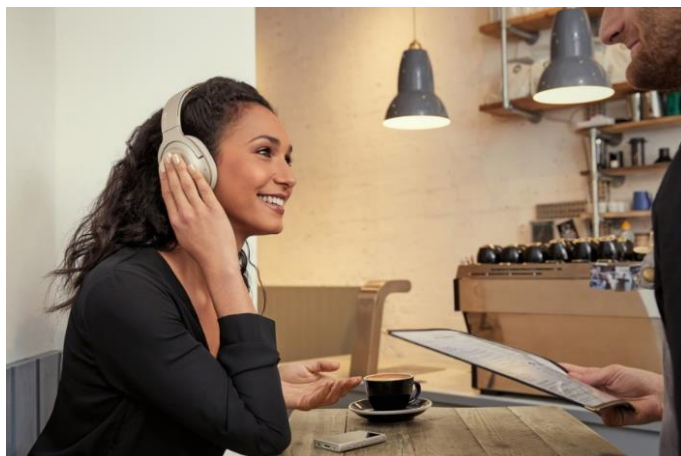
WH-H900N in Pale Gold

Battery life is key here too as the h.ear on 2 Wireless NC has 28 hours of battery life and Quick Charging for just 10 minutes to get 65 minutes more life in these Hi-Res compatible headphones, giving you the best in audio quality all day long.